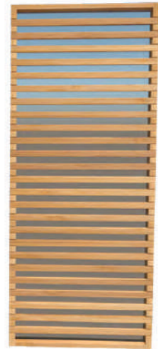
Semi-privacy panel (optional to replace glass panel)