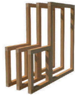
(4) -Bench Brackets