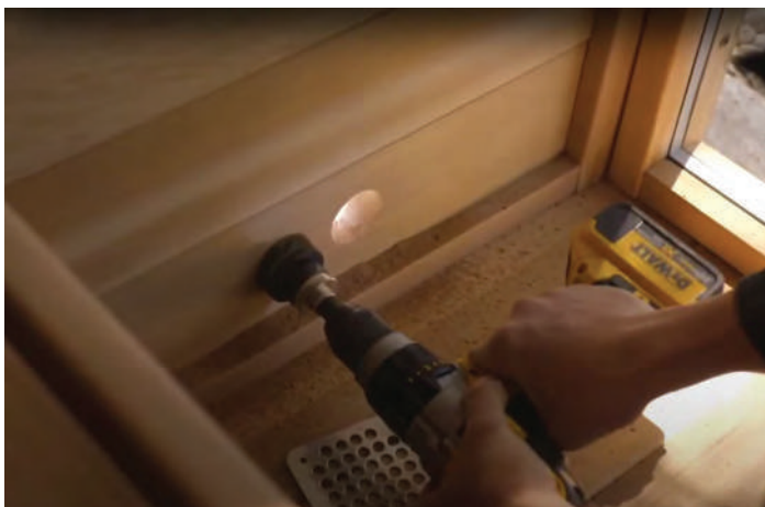
Inlet holes drilled under electric heater on side wall

For Saunas with wood heaters, get the inlet as close as possible to the wood heater and the outlet high in the opposite corner.