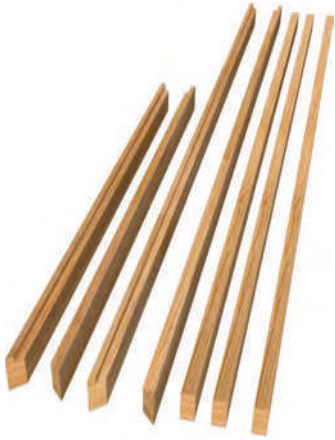
Floor Joists 4- Ends & sides 3- Middle Joists