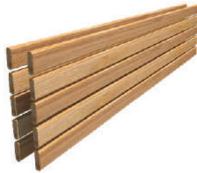
Bench Front Enclosures