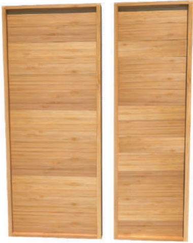
Privacy panels 3-large 3-small