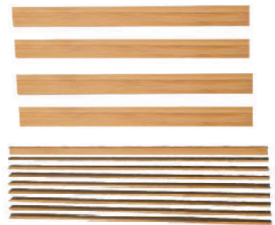
Door & Wall Trim

*Always ensure that you have the correct screw length so that there will be enough thread to hold, and especially, so that the screw does not go all the way through the material and come out the other side.