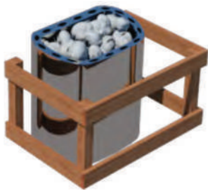
Electric Heater & Guard