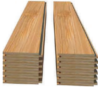
12 Full Floor Boards 1 Thinner Floor Board