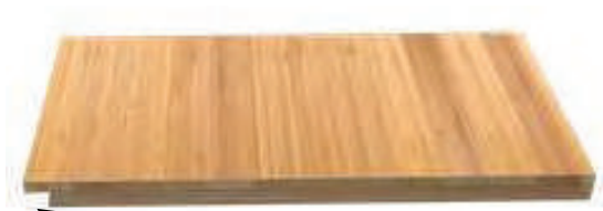
(2) Roof Panels (overhang on back)