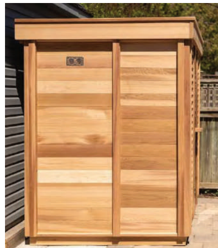
Outlet vent high on opposite wall of heater.