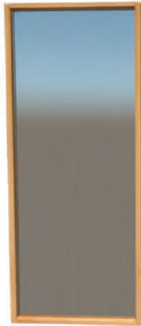
1- Glass panels